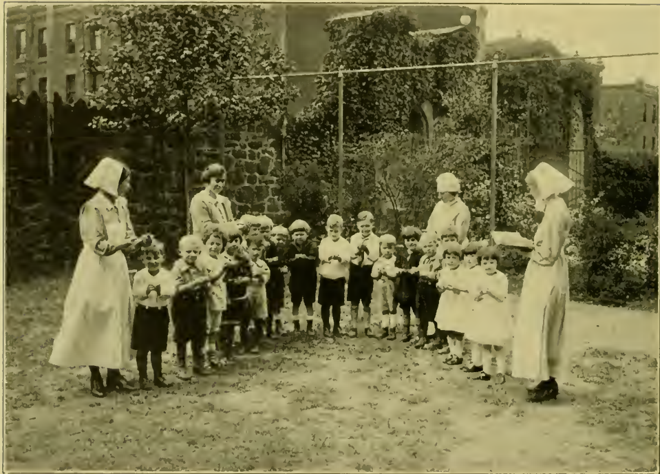
A Kindergarten at Play